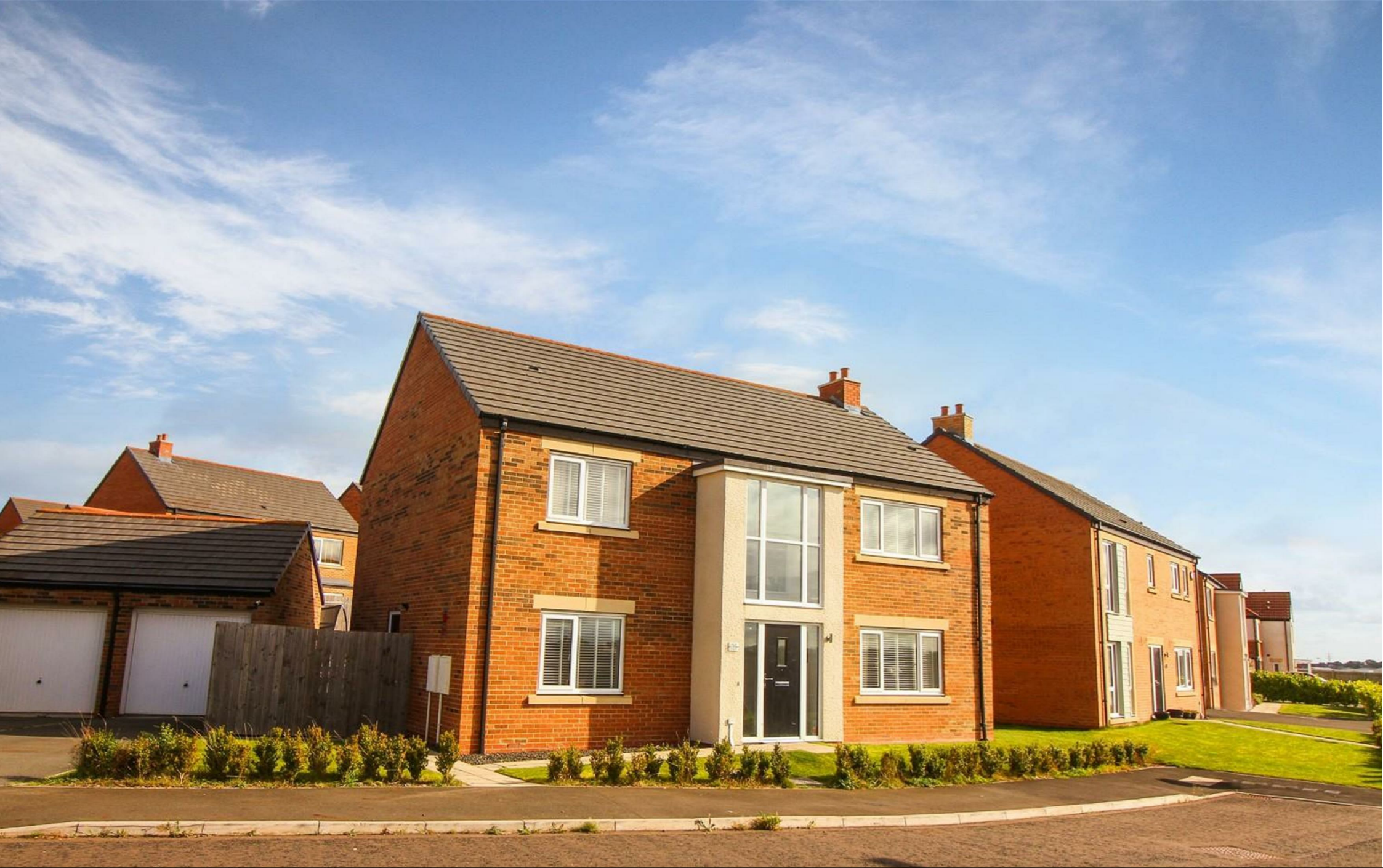
📍 Highfield Place, Newcastle Upon Tyne NE12 6BD